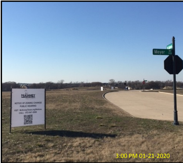
Above: Photo showing multiple signs along right-of-way and street sign.