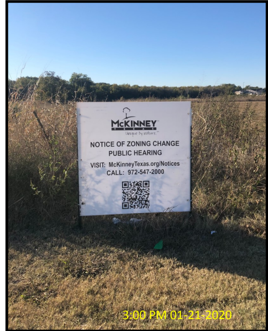
Above: Individual sign photo showing clear required text.